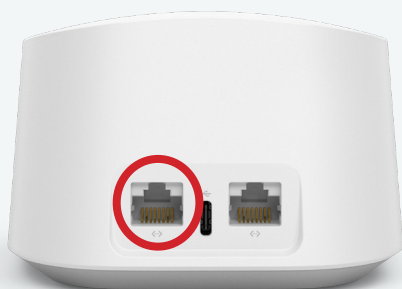
Back of the eero

* You will need to identify if your Opticomm service has an ONT is located outside on an external wall, an ONT located inside your home (often in the garage) or just an internal ethernet port wall socket (some apartment buildings) to connect to. If the OptiComm ONT is located outside there will be internal data ports where you connect your eero device. If your ONT is located inside you can either connect direct to it or use internal data ports if installed.